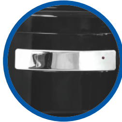
Hot Water Functioning Pilot Lamps