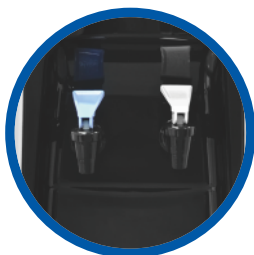
Cook and Cold water faucet