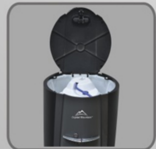
Retrofitted to Become a Point of Use Dispenser