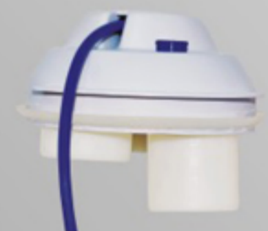
Point of Use Kit