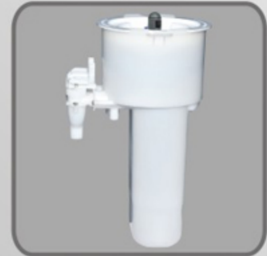
Removable Reservoir/Faucet Assembly (patent pending)