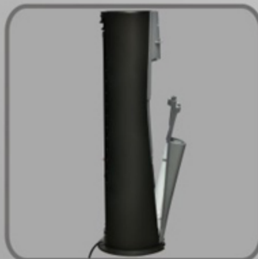
Replaceable Lower Front Panel with Optional Integrated Cup Dispenser