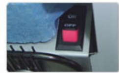
Hot water "ON" and "OFF" switch