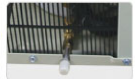
Cold tank drain