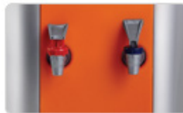
Child-proof hot water faucet