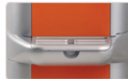
Removable drip tray