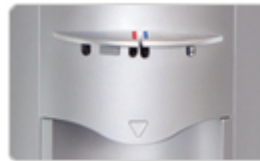
Concealed, one-piece, hygienic faucet