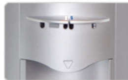
Concealed, one-piece, hygienic faucet