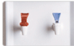
Child-proof hot water faucet