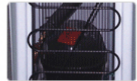
Hermetically sealed reciprocating Compressor