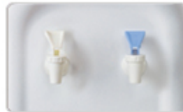
Cook & Cold water faucet